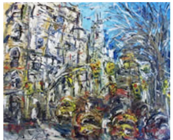
Central Park West, NYC, Chris Kappmeier

One of the foremost American artists of all time, this exhibition celebrates Homer's vision of the seashore and countryside. Dating to the 1870s, the works reflect the timeless appeal of Homer's love of country life at its simplest.