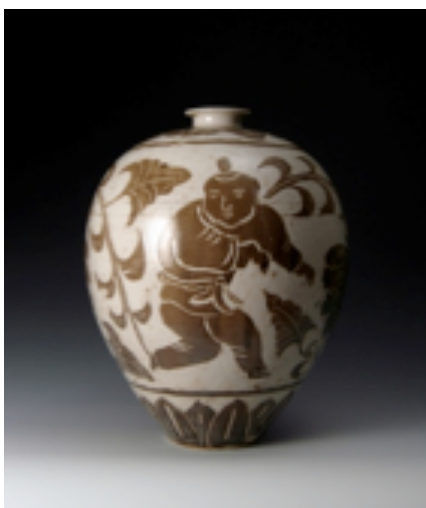
Brown-glazed sgraffito Ding Vase, 11th Century Northern Song Dynasty

Join fashion designer Freddie Johnson to create your own decorative floor covering. A $10 material fee paid to the workshop instructor is due the day of the workshop.